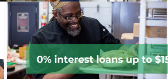
EXPANDING ACCESS TO CAPITAL FOR ENTREPRENEURS